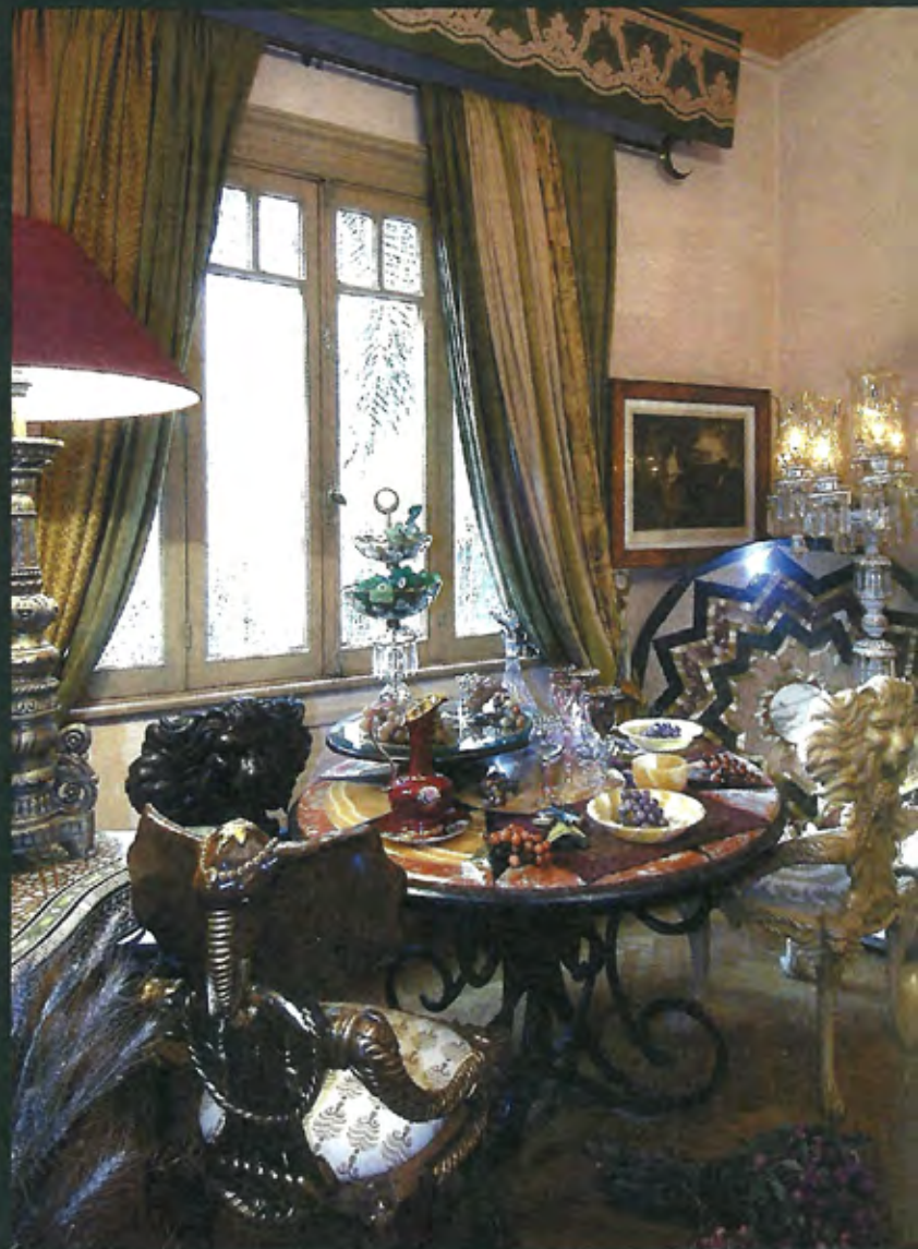
A visit to Alef Gallery in the heart of Cairo is comparable to traveling across the ages and into a time where the majesty of pharaohs and the magical tales of lost legends intertwined to create the unforgettable ambiance that was and still is the beating heart of Arabia.